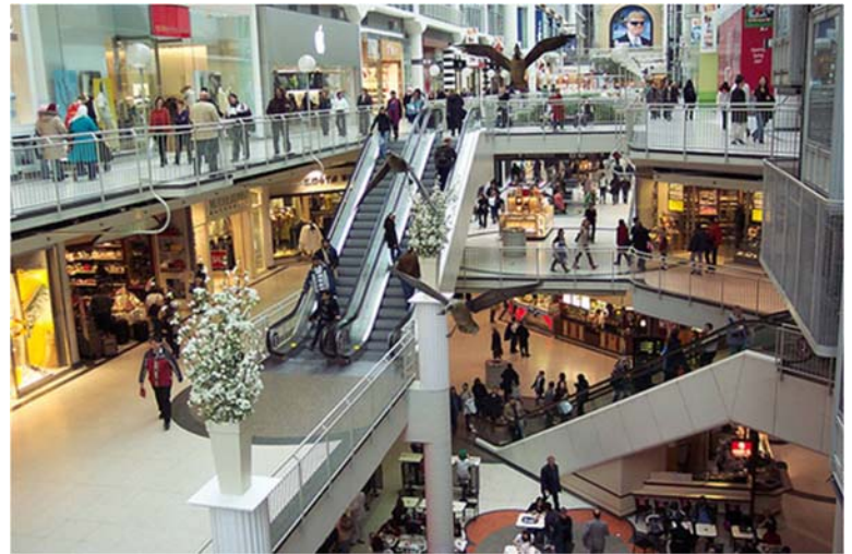
“Power Loss, South Escalator”