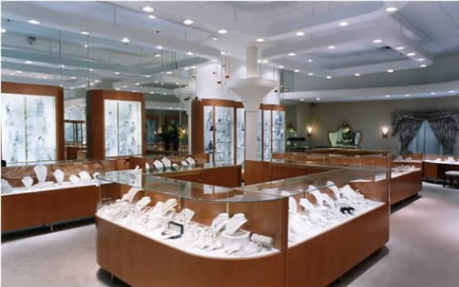
“Alarm activated at the Jewelers”

The WAVE Plus instantly transmits detailed messages directly to security officers and other first responders.